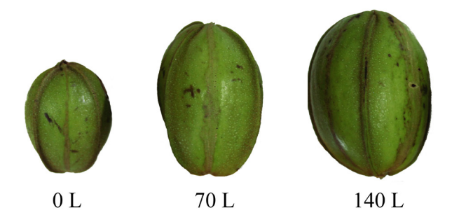
Figure 2. Nuts' size on March 25 (BBCH stage 79) under different amounts of water applied to the plants.

L) and 51.3% (140 L) lower than the number of fruits needed by plants without irrigation (0 L).